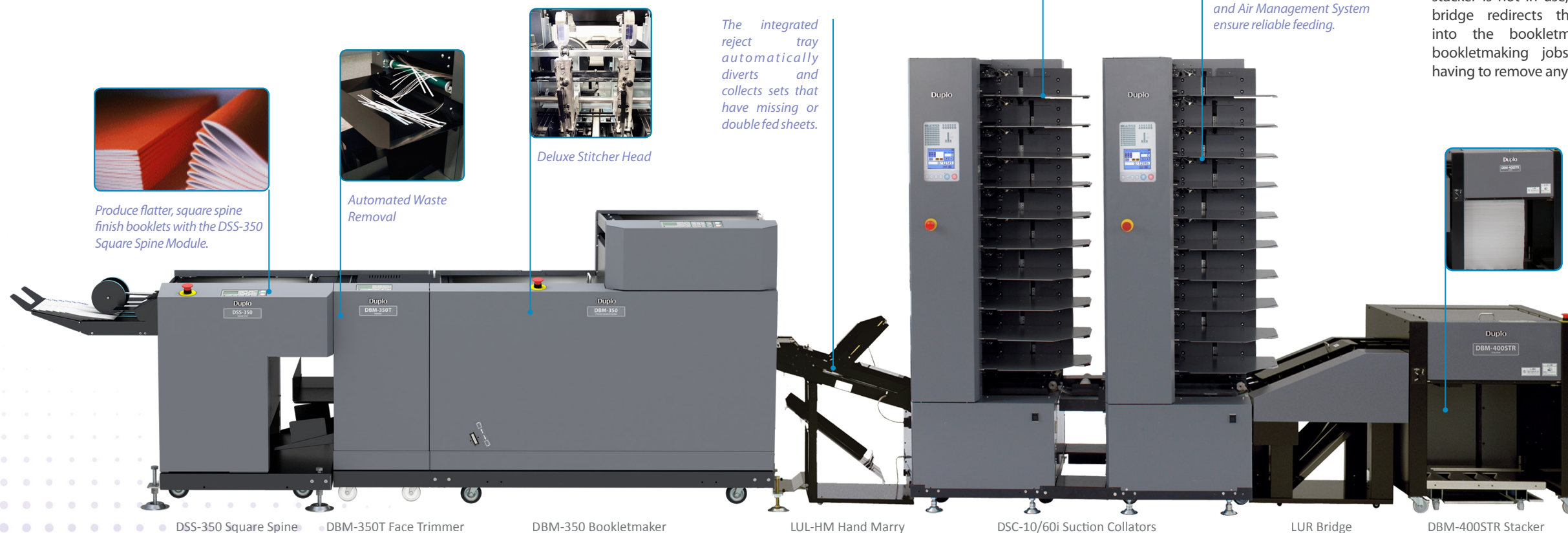
DSS-350 Square Spine