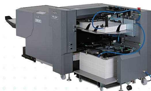
150 Digital Booklet System | DSF-2200 with DBM-150S/DBM-150T |

The 150 Digital Booklet System is Duplo's entry-level sheet feeding system connecting the DSF-2200 with the DBM-150S Bookletmaker. Featuring the Isaberg Rapid stapler and staple cartridge, the DBM-150S Bookletmaker produces a high quality, flat staple every time. Each cartridge holds 5,000 staples and wear parts are replaced each time the cartridge is changed out, providing a high level of reliability. The DBM-150S Bookletmaker can be operated via the control panel where up to 16 jobs can be saved in memory or via a PC using the optional PC Controller. Compact in size yet built-in with high performance features, the 150 Digital Booklet System produces superior corner, side, or saddle-stapled applications up to 1,720 booklets per hour.