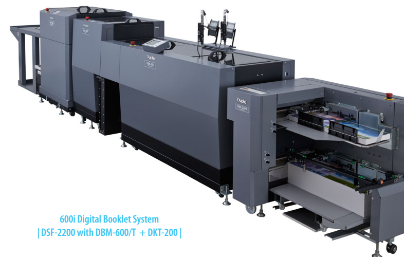
600i Digital Booklet System | DSF-2200 with DBM-600/T + DKT-200 |

350i Digital Booklet System DSF-2200 with DBM-350/T shown on cover