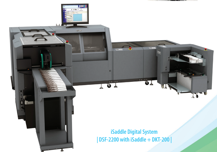
iSaddle Digital System | DSF-2200 with iSaddle + DKT-200 |