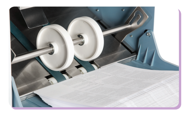
Delivery roller automatically sets paper size . Two tray positions are available for enhanced stacking.