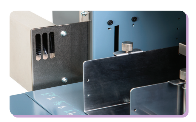
An optional Side Air Kit can be added to enhance the feeding of heavy stock and large paper sizes.