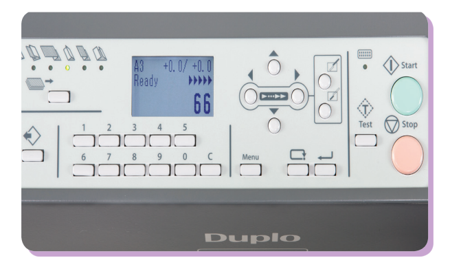
The DF-1200 comes pre-programmed with six standard fold types, making it easy to fold a wide range of applications at the touch of a button. Users can also create custom fold styles simply by moving the fold plates via the user-friendly control panel and save them in one of the 20 job memories.