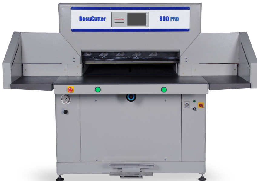
| 800 PRO Cutter |